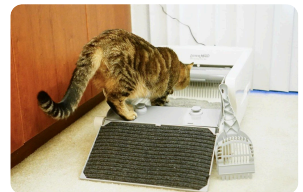
a litter box for cats