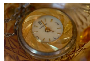
It's 5 o'clock somewhere.