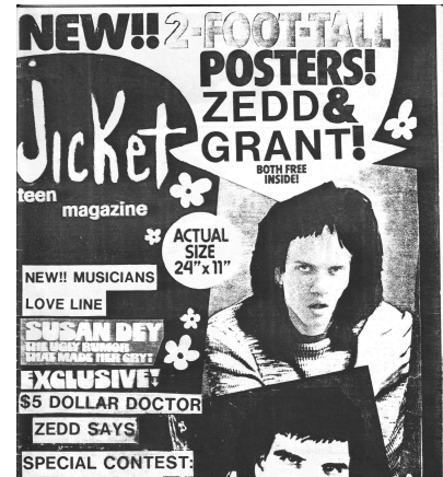
Jicket Teen magazine

Until the Internet came up, people got news and information from newspapers and magazines. Special magazines for teenagers first came up in the United States in the 1940s. A prominent teenager magazine "BRAVO" is published in Germany since 1956. Today you take a look at some teenager magazines. You can find out, what they are about.