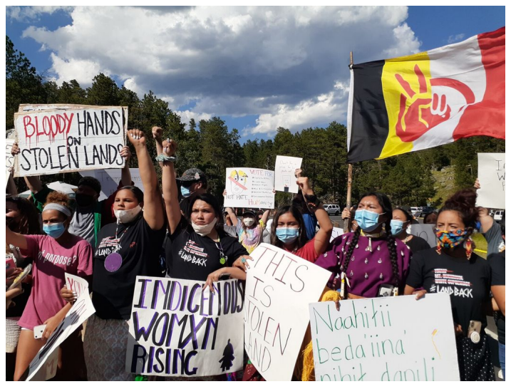
(2) \widehat{\mathbb{S}}_{\leq}^{<} Listen to the text about the situation of Native Americans today.